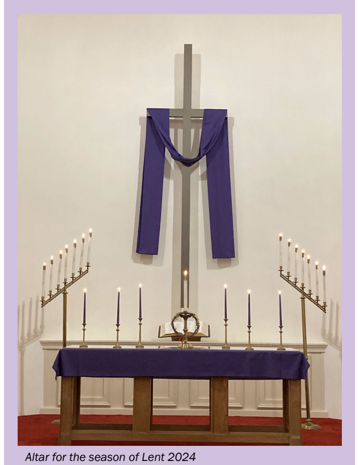
Altar for the season of Lent 2024